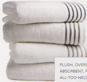
PLUSH, OVERSIZE AND ULTRA-ABSORBENT, PREMIUM TOWELS ARE ALL-TOO-NECESSARY LUXURIES. MACY'S HOTEL COLLECTION "MICROCOTTON BORDER TOWELS," $25 EACH. MACY'S, 3393 PEACHTREE RD. NE, ATLANTA 30326. (404) 231-2800; MACYS.COM