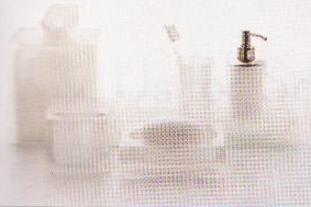
A TRAY OF TRANSLUCENT ETCHED-RESIN ACCESSORIES ADDS ICY FLAIR TO A COUNTERTOP TABLEAU. WATERWORKS "GLACIER" COLLECTION. $80-$185; $935 FOR THE SET. 1 WEST PACES FERRY RD., ATLANTA 30305. (404) 266-1080; WATERWORKS.COM