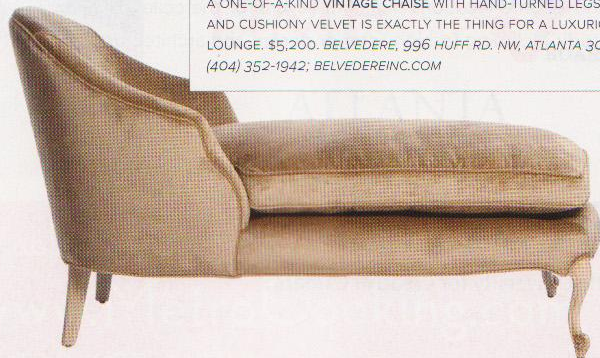
A ONE-OF-A-KIND VINTAGE CHAISE WITH HAND-TURNED LEGS AND CUSHIONY VELVET IS EXACTLY THE THING FOR A LUXURIOUS LOUNGE. $5,200. BELVEDERE, 996 HUFF RD. NW, ATLANTA 30318. (404) 352-1942; BELVEDEREINC.COM