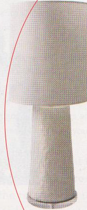
FORGO BOLD, POLISHED FIXTURES FOR SUBTLY TEXTURED ALTERNATIVES, LIKE THIS TABLE LAMP FASHIONED FROM RECYCLED CEMENT BAGS BY HAITIAN ARTISANS. PAPIER-MÂCHÉ "CYLINDER LAMP," $485. VERDE HOME, 1000 MARIETTA ST. NW, ATLANTA 30318. (404) 754-6365; VERDEHOMEINC.COM